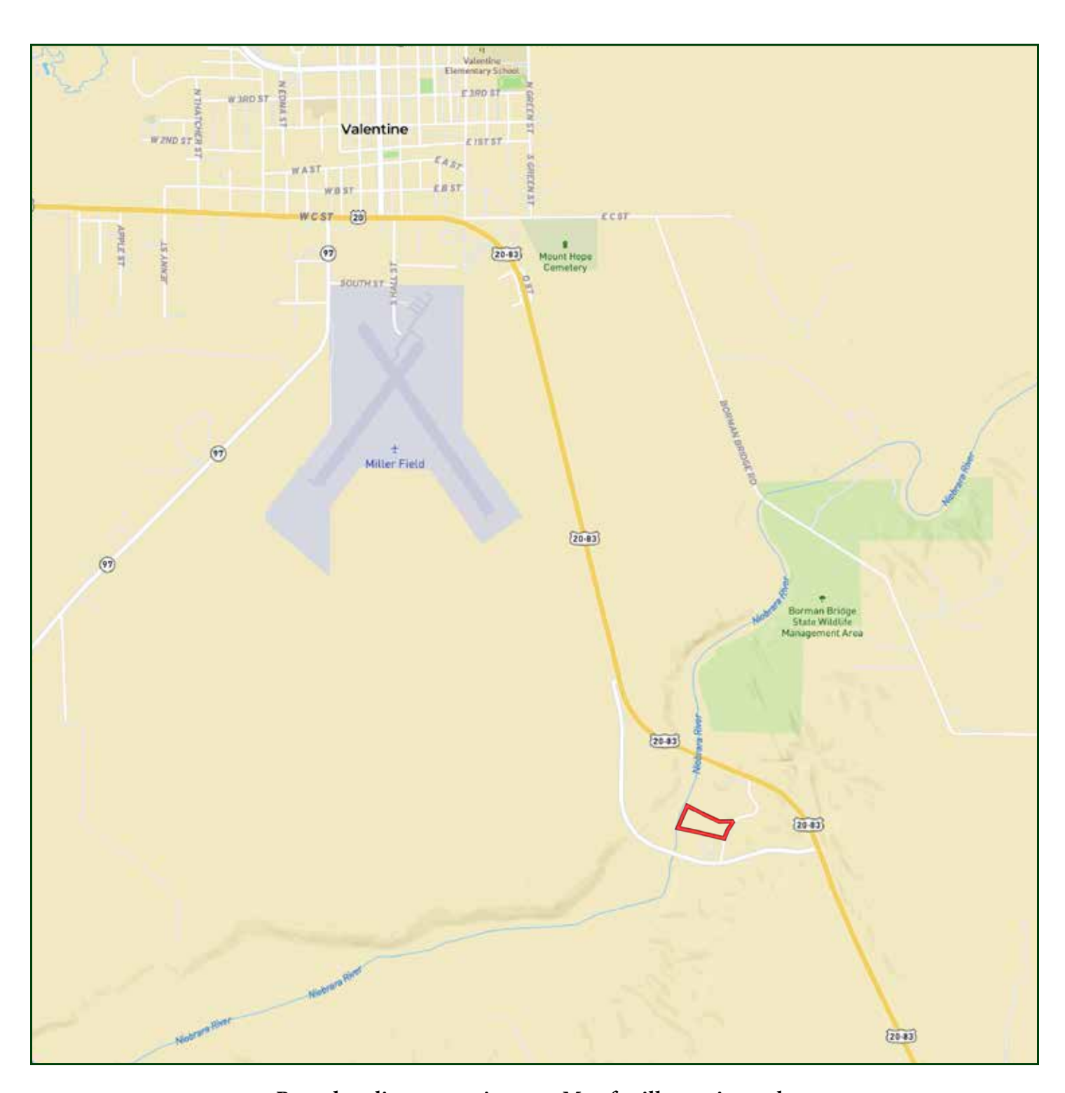
Boundary lines are estimates - Map for illustration only