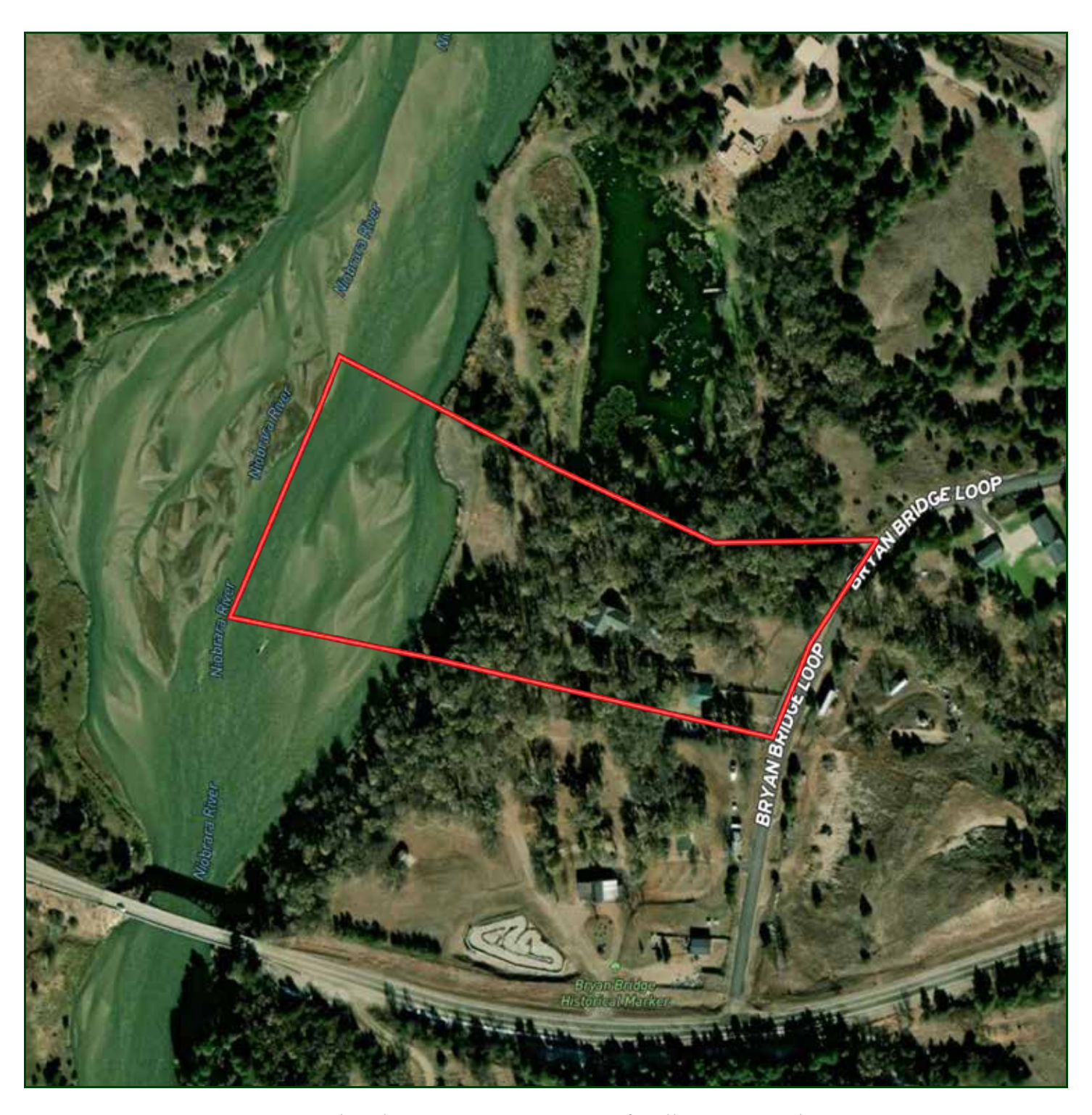
Boundary lines are estimates - Map for illustration only