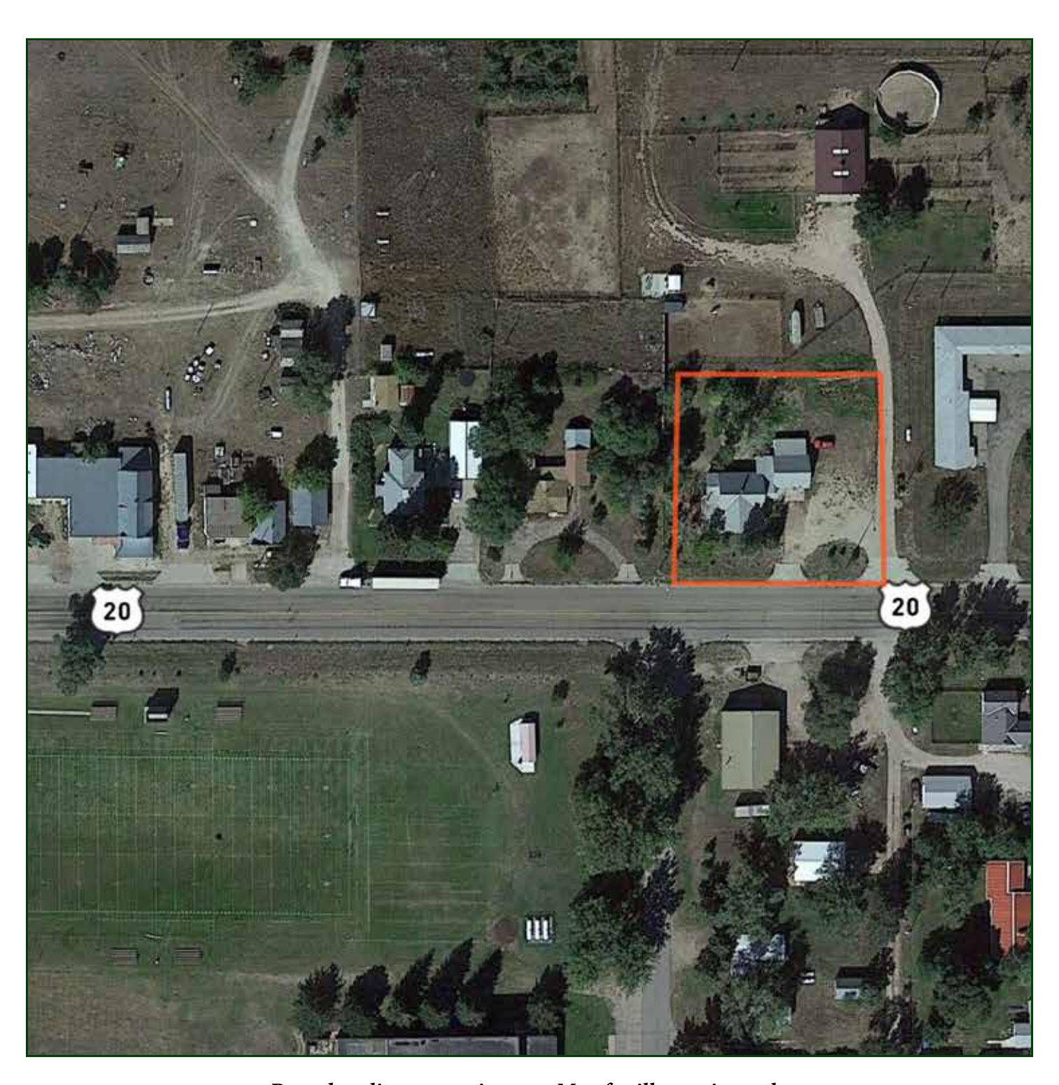
Boundary lines are estimates - Map for illustration only