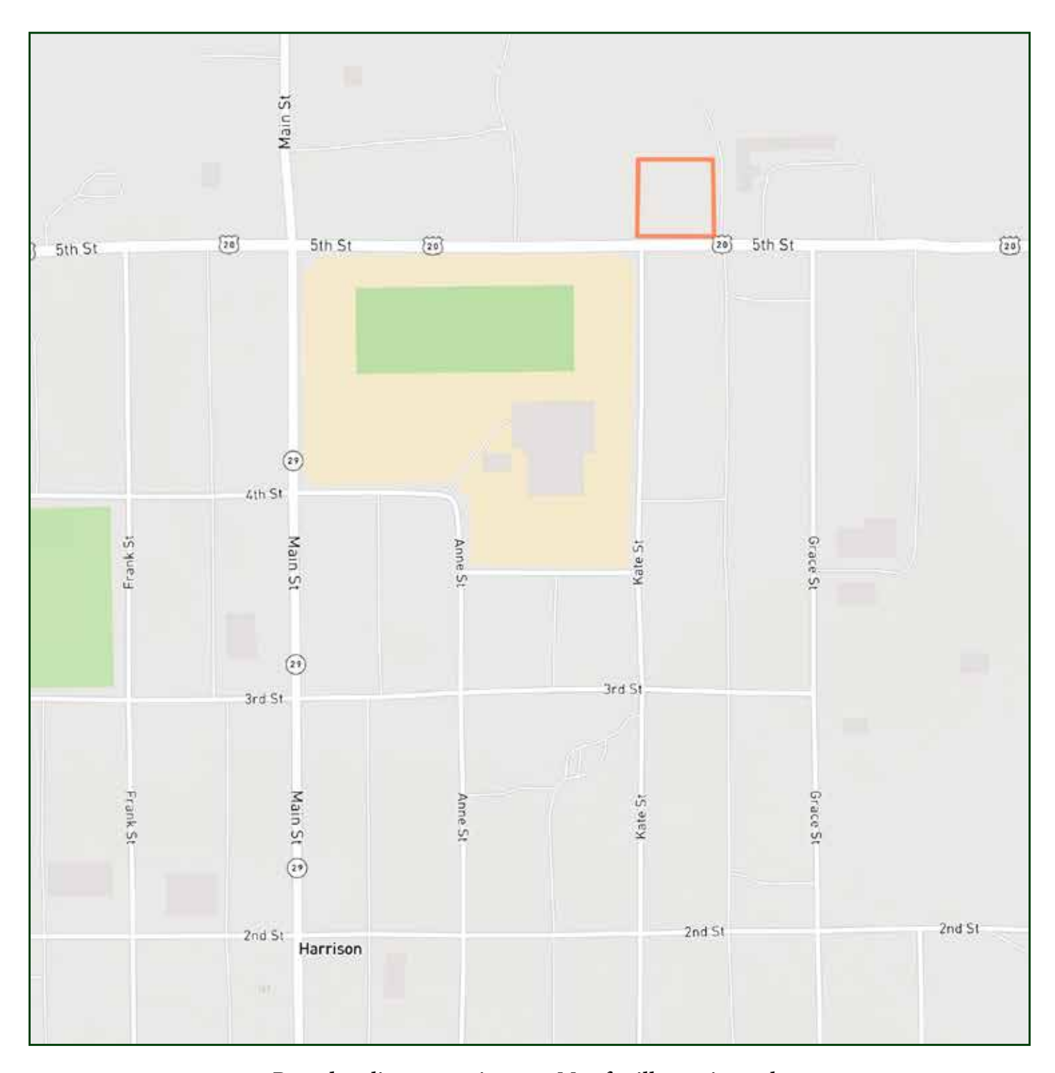
Boundary lines are estimates - Map for illustration only