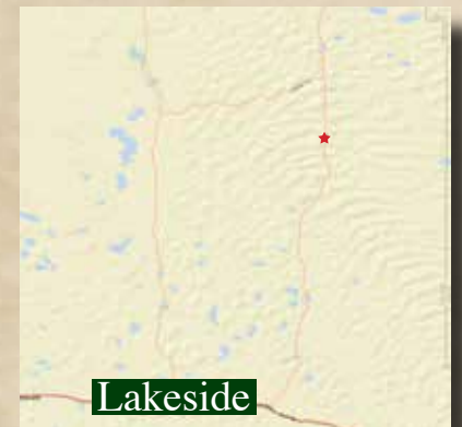
Golden Spade Building