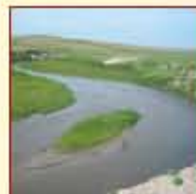
Birdwood Creek Ranch