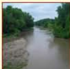
Republican River Whitetails