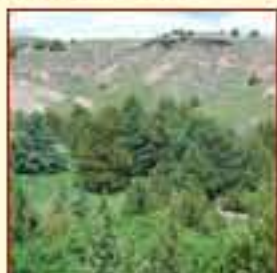
Mulie Buttes Ranch